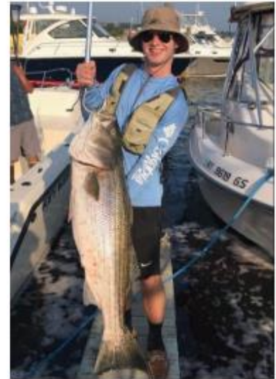
Director of Social Media/Marketing